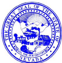
STEVE SISOLAK Governor

400 W. King Street, Suite 106 Carson City, Nevada 89703 (775) 684-7040 • Fax (775) 684-7052 http://minerals.nv.gov/