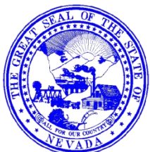
STEVE SISOLAK Governor

400 W. King Street, Suite 106 Carson City, Nevada 89703 (775) 684-7040 • Fax (775) 684-7052 http://minerals.nv.gov/